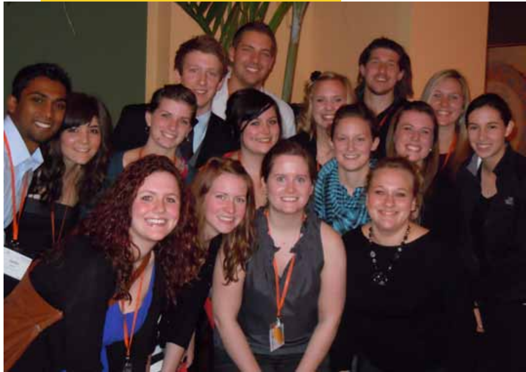
Sixteen North Park students attended the 2011 Alliance Management Institute in Orlando, Fla.

As the first generation to enter the nonprofit career field by design, these students are prepared to make a significant impact in our communities.