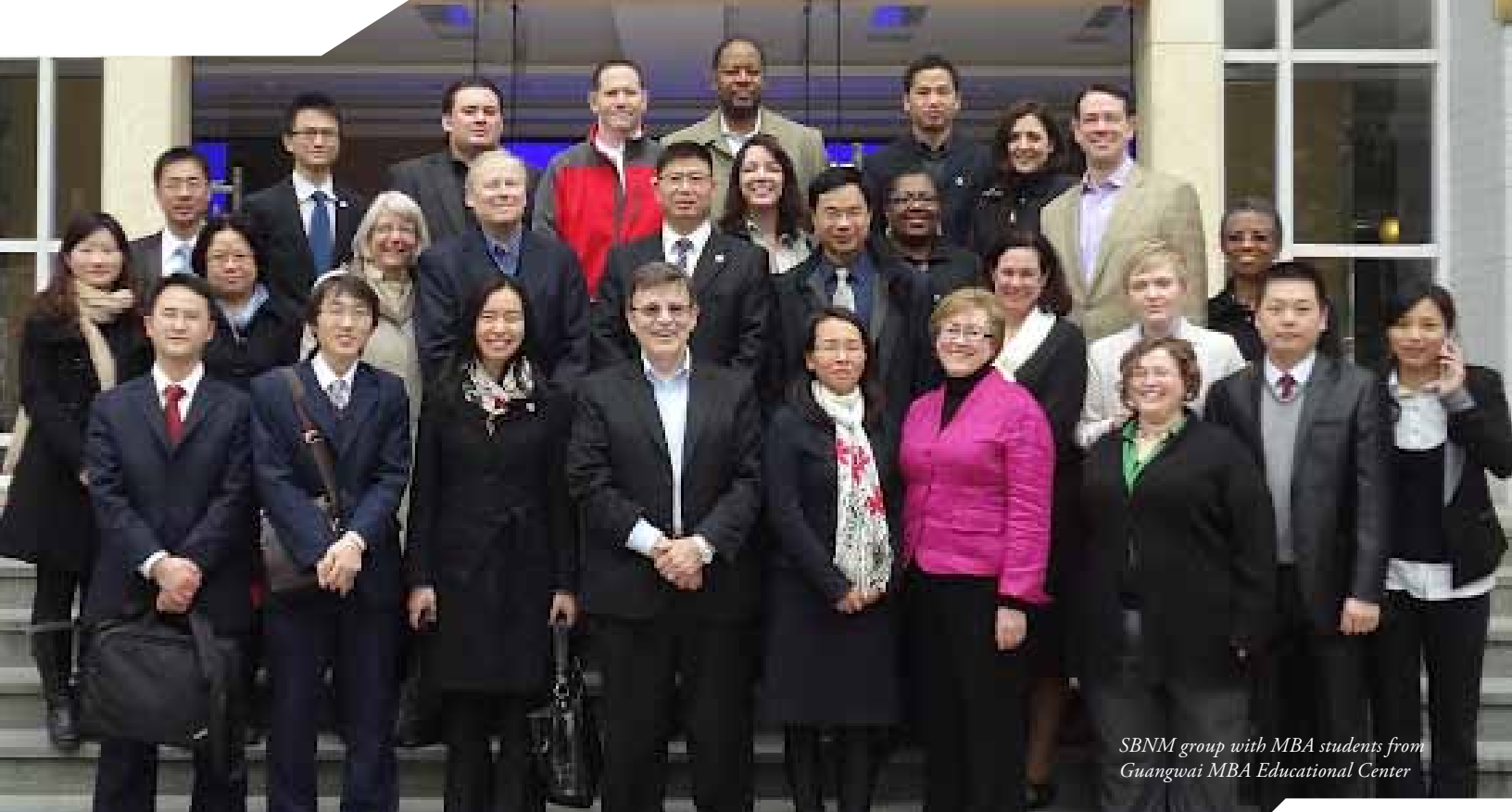
SBNM group with MBA students from Guangwai MBA Educational Center