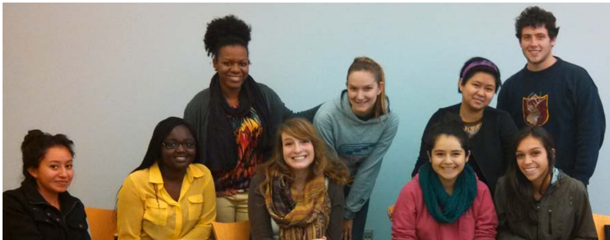
Nonprofit Leadership Club members

This is a defining year for the Nonprofit Leadership Club at North Park. The NLA national conference is in Chicago (January 2014) and we have 25 representatives from North Park attending. This is amazing and is five fold the number of previous attendees at this conference! This is a wonderful opportunity to increase awareness of North Park and the wonderful students who exemplify who we are and seeing our distinctives in practice. ■