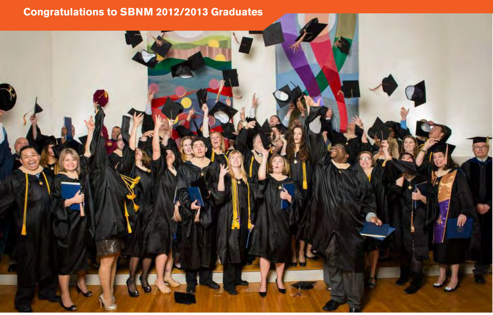
Click here to go to SBNM website for complete list of 2012/13 graduates.